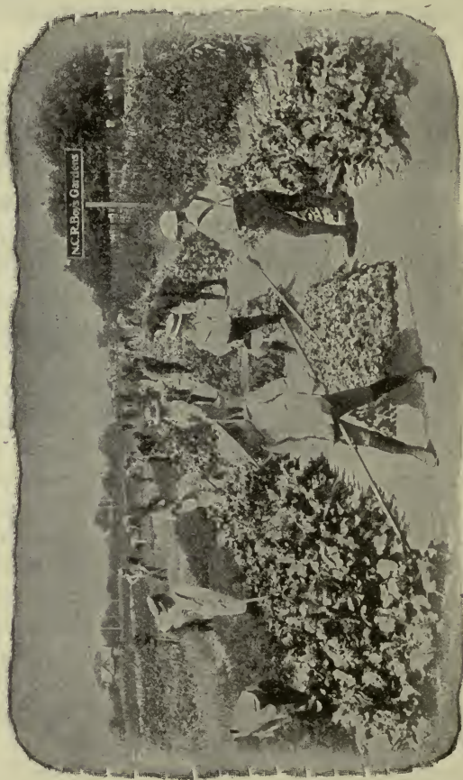
An Afternoon Gathering of the Boy Farmers.

supporting principle into use, if, as we are fully persuaded, it is the best and most scientific method for gaining an industrial training.