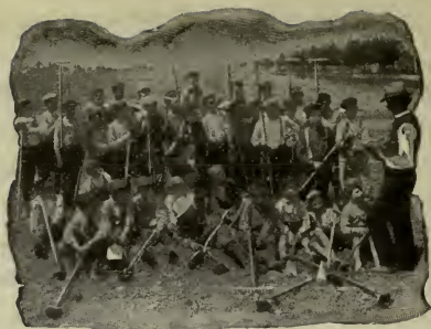
Receiving Instructions from Head Gardener.