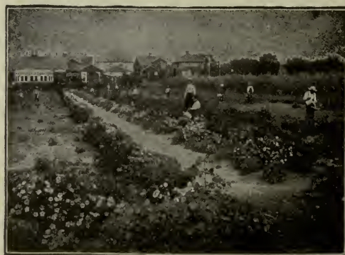
The Flower Path.